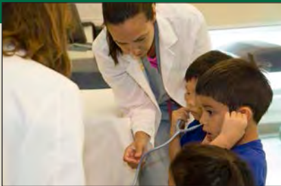
Apr. 2013 - Unity Preschool pupils visit JABSOM to learn about health careers.