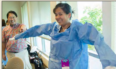
July 2013 - Members of the Class of 2015 learn to suit up for surgery as they began Transition to Clerkship week.