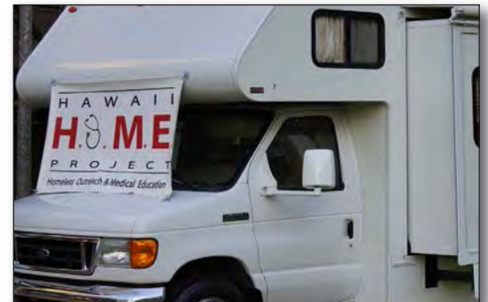
The new HOME Project mobile health clinic.